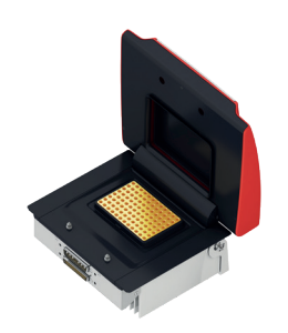
96-well silver-block module

For highest demands in speed and uniformity