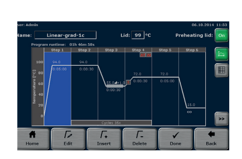
Graphical programming interface

Users are always on the safe side: On a regular basis or based on individual need, an extended self-test can be carried out to check all relevant features such as cooler, heating, cooling rates and more. All results are stored in a report and can be shared with the technical service.